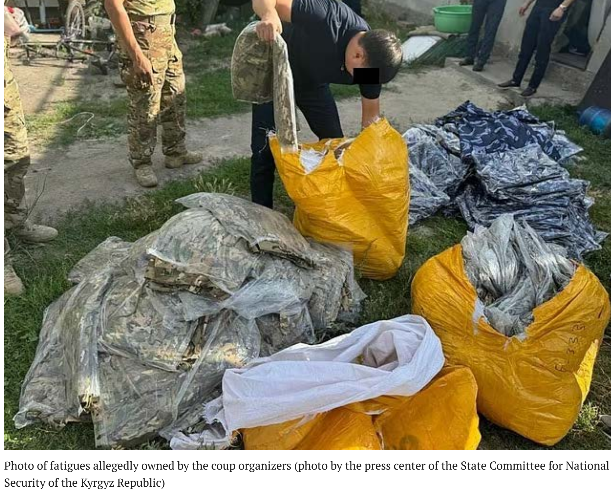
Although just five men were arrested, photos show a number of plated vests and

dozens of fatigues, meaning security forces are likely to detain other suspects as the investigation continues. Kyrgyzstan's Last Coup